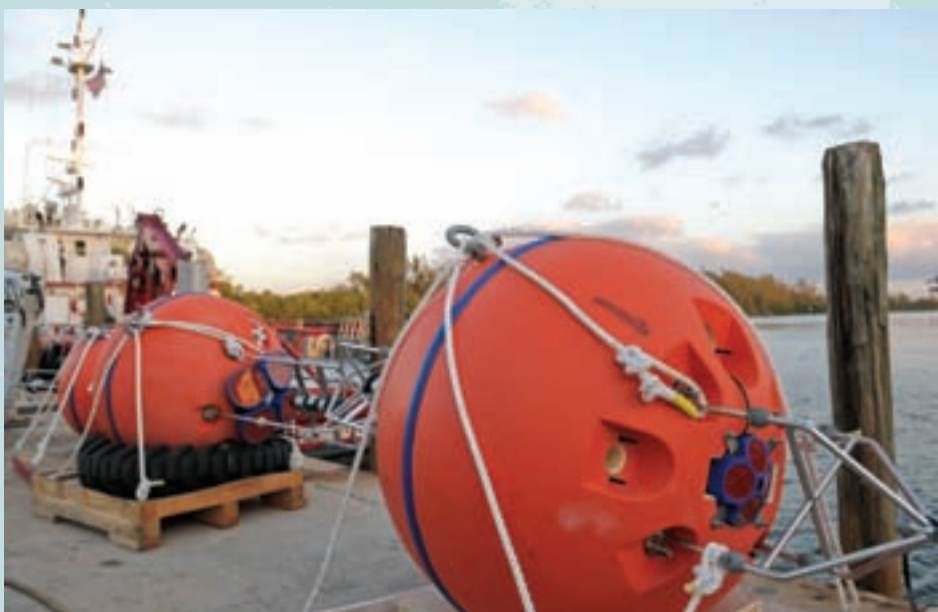
The Acoustic Doppler Current Profilers are helping scientists at Florida Atlantic University gather baseline information, which is needed to characterize in detail the spatial and temporal variability of the Gulf Stream, the most energy dense ocean current, for its potential use as an abundant renewable energy source.