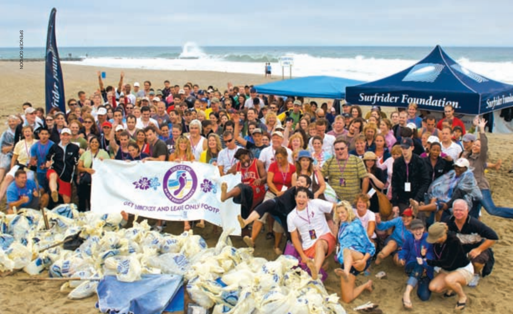
Even Tropical Storm Danny could not dampen the spirits of these volunteers in Asbury Park, NJ.

sun, cleaning the beach so students could enjoy the Blast for years to come. In addition to the “Tuesday Beach Sweep,” the Cape Fear Chapter also performs sweeps throughout the year, primarily at Wrightsville Beach, Carolina Beach and Masonboro Island. They also do cleanups on the UNCW campus.