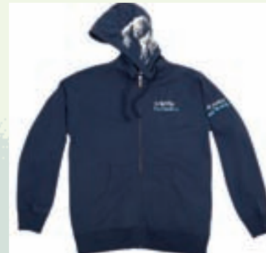
MEN'S "WAVE" HOODIE Made from 100% organic cotton, it features "Surfrider Foundation" on the front, "Protect and Surf" on the left arm, and a wave on the hood. $50.00 (S-M-L-XL-XXL)

ORDER ONLINE: WWW.SWELL.COM/SURFRIDER OR CALL (800) 255-7873 MANY MORE ITEMS AVAILABLE ONLINE!