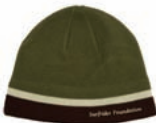
SURFRIDER FOUNDATION ORGANIC STRIPE BEANIE Made from 100% organic cotton with a blend of earth-tone yarns. $14.95