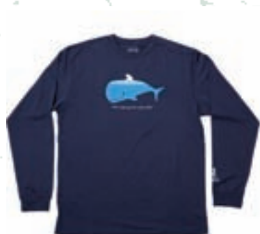
MEN'S "WHALE & POLAR BEAR" Features "Let's Look Out For Each Other" on a navy long-sleeve organic t-shirt $24.00 (S-M-L-XL-XXL)