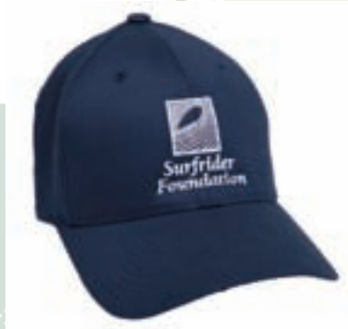
SURFRIDER FOUNDATION FLEXFIT HAT Made of bamboo/organic cotton blend and embroidered in white on indigo. $24.95