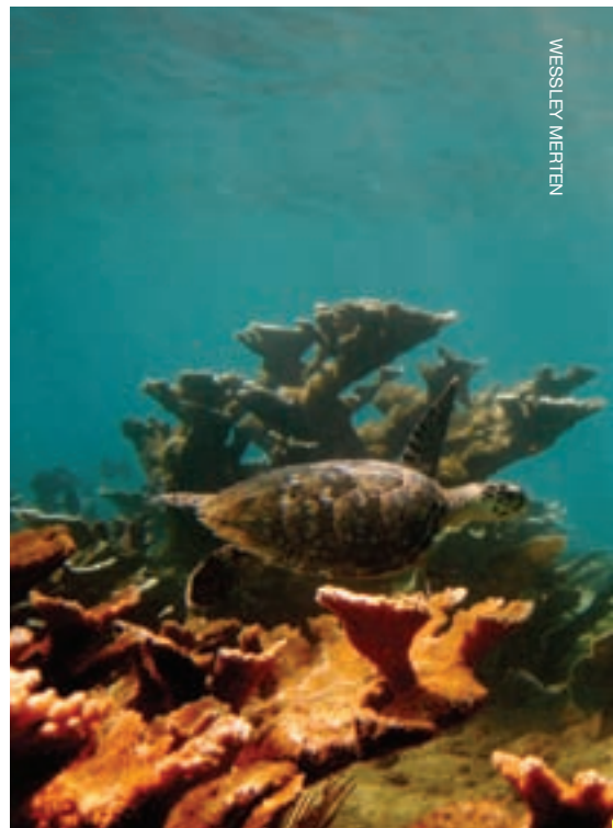
Elkhorn coral provides habitat for a myriad of species including the endangered Hawksbill sea turtle.

A wealth of information on the campaign, the Reserva Marina Tres Palmas, and local activism can be found at: www.surfrider.org/rincon