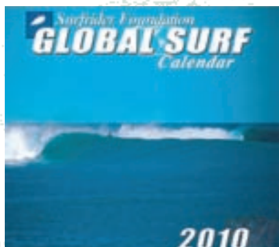
2010 SURFRIDER FOUNDATION GLOBAL SURF 12-MONTH CALENDAR $12.95