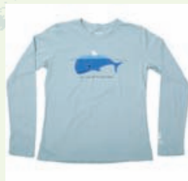
WOMEN'S "WHALE & POLAR BEAR" Features "Let's Look Out For Each Other" on a sky blue long-sleeve organic t-shirt $24.00 (S-M-L-XL)