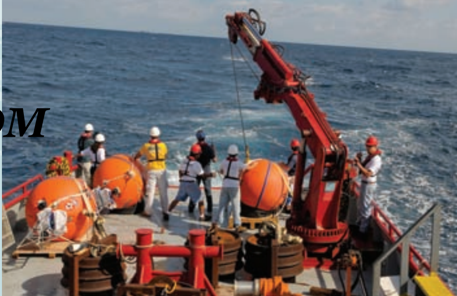
Florida Atlantic University's Center for Ocean Energy Technology has deployed Acoustic Doppler Current Profilers in South Florida to evaluate the state's ocean energy resources in the Gulf Stream.

On the surface, Puget Sound is spectacular with bald eagles, seals, orca, and sea birds seemingly in abundance. However, you don't have to look far below the surface to get a glimpse of the threatened state of the Sound. The resident orca population, just one of many local species now listed as endangered, is considered to be one of the most contaminated marine mammals on the planet. With strong recovery efforts under way for the entire Puget Sound basin, allowing new tidal power projects with unknown environmental impacts requires careful consideration.