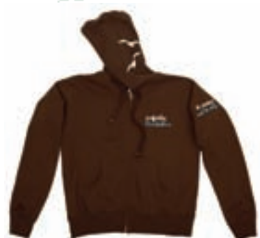
WOMEN'S "SEAGULL" HOODIE Made from 100% organic cotton, it features "Surfrider Foundation" on the front, "Protect and Surf" on the left arm, and seagulls on the hood. $50.00 (S-M-L-XL)