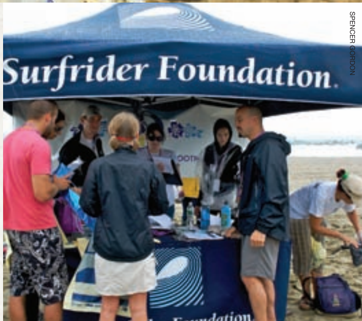
Jersey Shore and NYC Chapter activists and Barefooters keeping dry before the Beach Rescue Concert.

At the end of August, the Jersey Shore Chapter was treated to a Beach Rescue Concert that celebrated twenty-five Barefoot Wine beach cleanups in honor of the Surfrider Foundation’s 25 th Anniversary. Barefoot Wine and Hunter PR helped the Chapter host a massive beach cleanup along the entire Asbury Park beachfront with hundreds of volunteers participating despite the poor conditions...it was windy and wet thanks to Tropical Storm Danny passing close to the shore. Following the cleanup, all volunteers over 21 received VIP treatments at the Convention Hall in Asbury Park for the Beach Rescue Concert, including complimentary food and wine. More than 2,000 attended the free concert, which had Mason Jennings , the Cold War Kids , Gavin DeGraw and Joss Stone performing. In addition Reverbr Rock was on-site to green the show by offsetting most of the carbon emissions and ensuring that no petroleum-based plastics