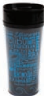
"ICONIC" TRAVEL MUG Features 25 of the world's most iconic waves in honor of the Surfrider Foundation's 25th Anniversary. Made from recycled plastic and is BPA free. $12.95